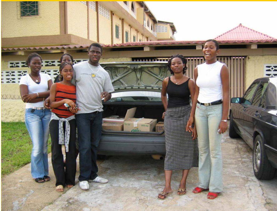
UIGB Students packing up donations for an orphanage